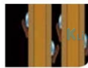
Condensation water washes away the dust and grease