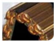
The gold-plated evaporator keeps dust and grease from sticking

* Self-cleaning: The unit operates at low fan speed and the condensate water washes away the dust from the evaporator golden, hydrophilic fins, then air dries the evaporator. The whole process cleans the indoor unit coil and prevents the breeding of bacteria and mildew growth.