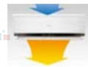
When the unit is off, the cleaning system dries the evaporator